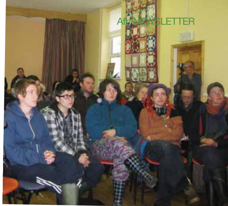
Glenamoy Community Centre

To be in Mayo on Saturday 21st and Sunday, 22nd of May, meant to be on the side of justice, peace, people's right to food and to freedom from corporate abuse.