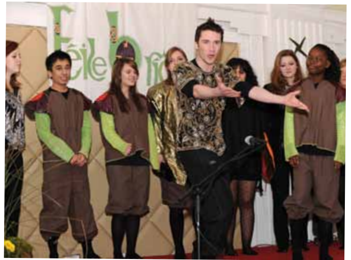
Students of Coláiste Éinde, Galway, performing their theatre piece