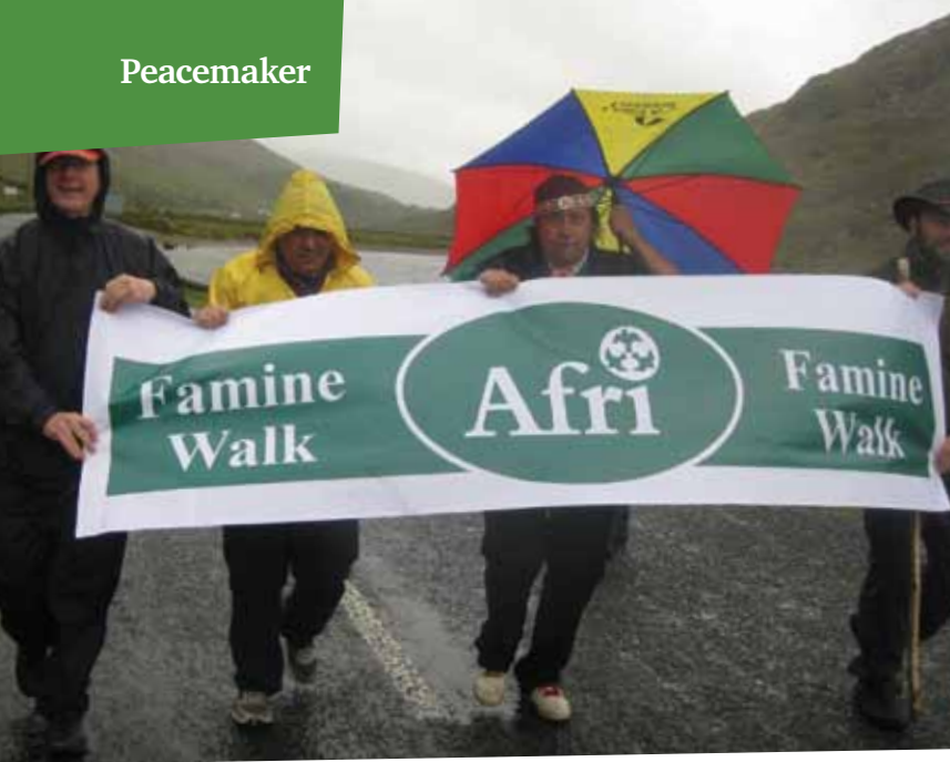
Walkers contend with rain and wind during the 2011 Famine Walk